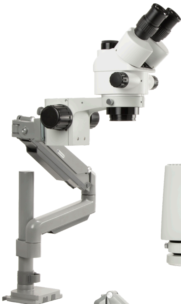
● ENZ-9047 with StereoBlue zoom head