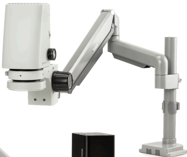
● ENZ-9047 with EMZ-4600 head