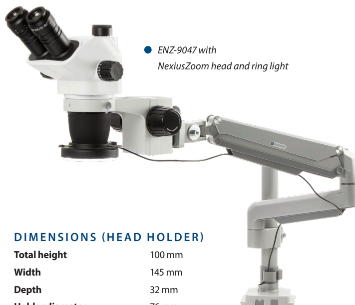
● ENZ-9047 with NexusZoom head and ring light