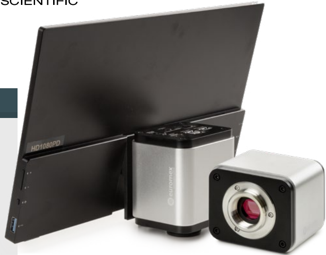
● EVC-3048 / EVC-3048-HDS