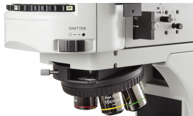
● Revolver with slot for Nomarski DIC slider