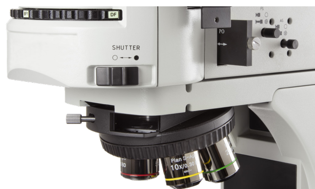
● Revolver with slot for Nomarski DIC slider