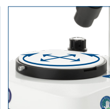
Moveable object stage