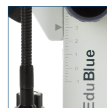
Quick focus scale