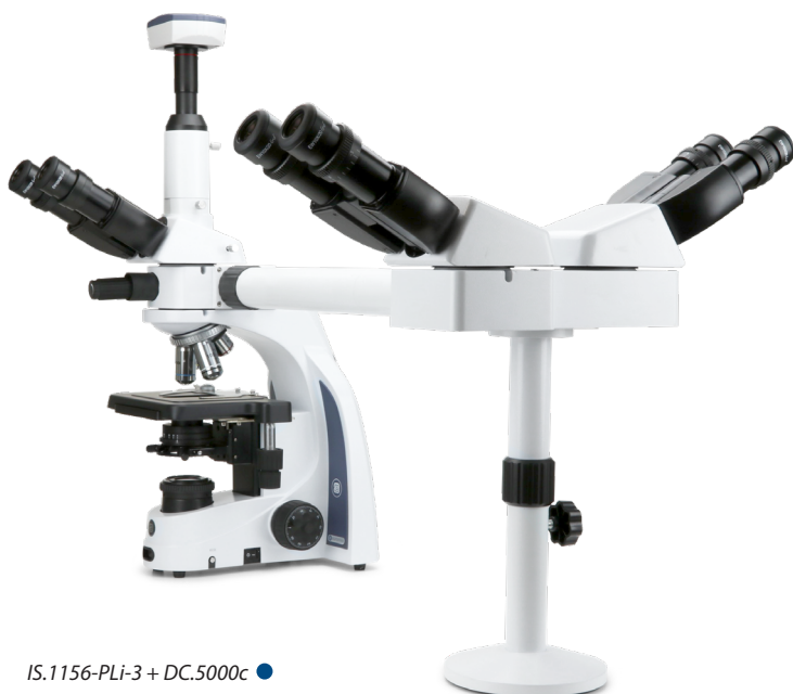
IS.1156-PLi-3 + DC.5000c ●